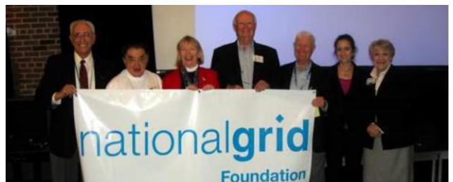
nationalgrid Donation Project