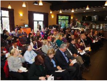
Audience of 103 attendees