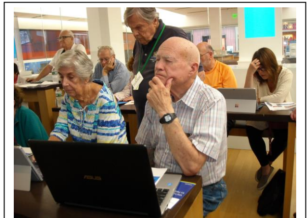
Microsoft store Windows 10 workshop