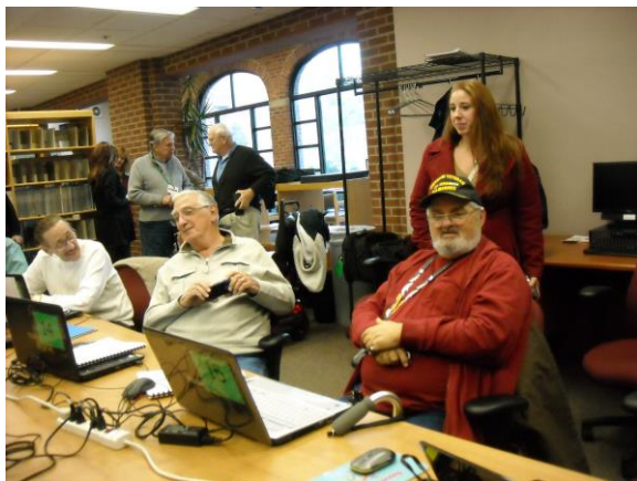
Mobile Classroom at the VA Hospital