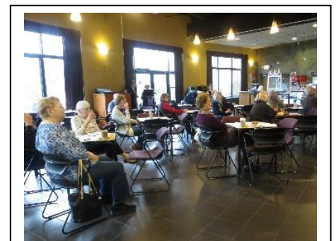
Cinema Arts Centre Training Session

Cinema Arts Centre of Huntington partnered with SeniorNet LI to host a special website training session for its patrons. On the rainy, very windy and cold morning of Monday, March 14, 2016, SeniorNet held this free training seminar in the Cinema Arts Centre Sky Room Café. The 20 attendees who defied the morning's stormy weather were treated to refreshments and a presentation. We attempted to provide the same program on September 12, but unfortunately, the weather again proved most unaccommodating. SeniorNet and Cinema Arts are taking a new approach for 2017. We look forward to a successful partnership.