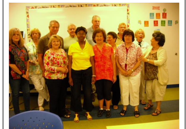
Bellport students and staff