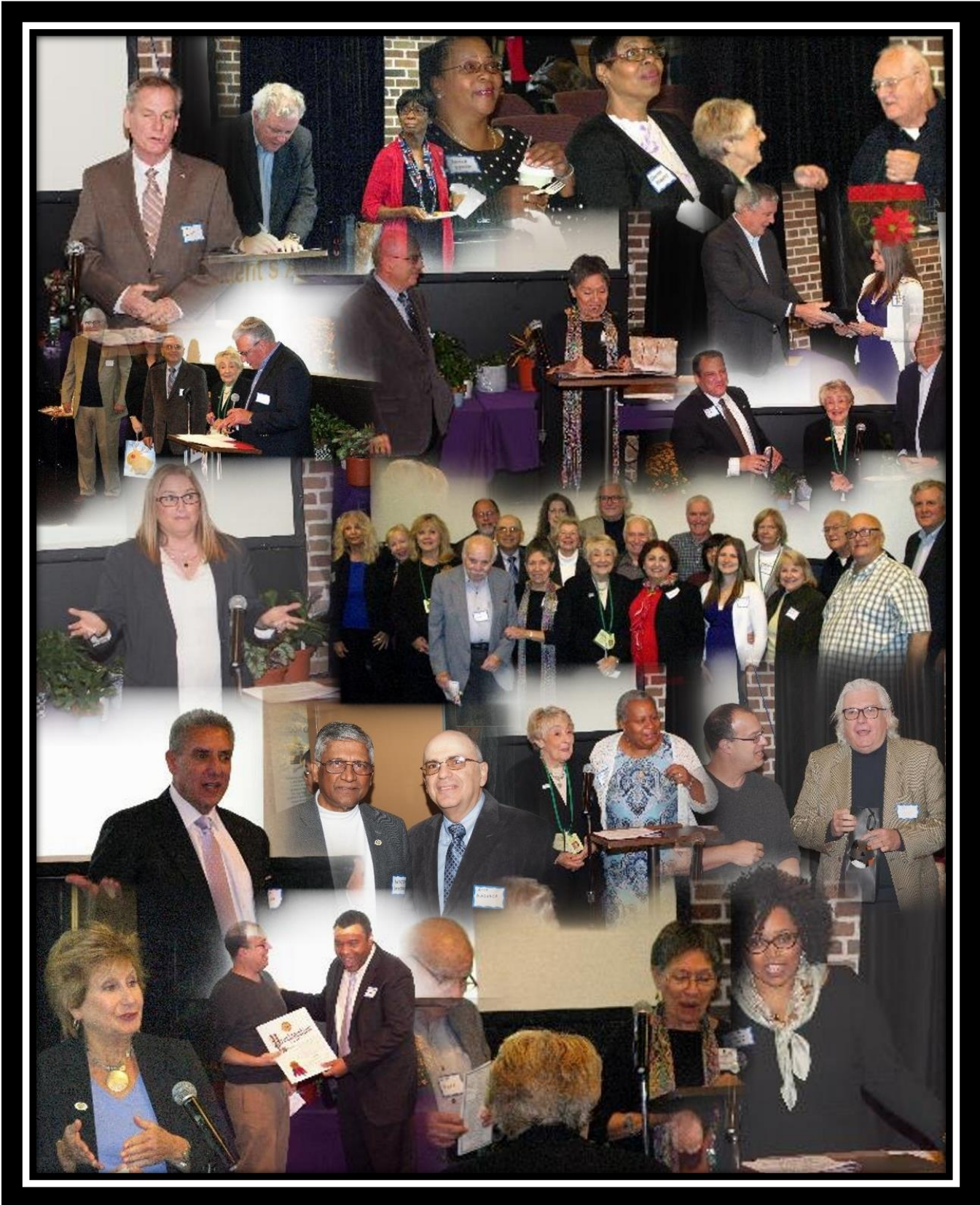
Collage of Annual Meeting Photographs