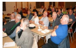
Volunteers attending annual training session

Throughout the year our volunteers host various events that include registration open houses, parties, picnics, luncheons and training meetings. These volunteer events are part of an overall effort to increase volunteer participation, meet and greet other volunteers, and provide opportunities for networking with each other.