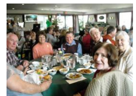
Volunteer Spring Luncheon